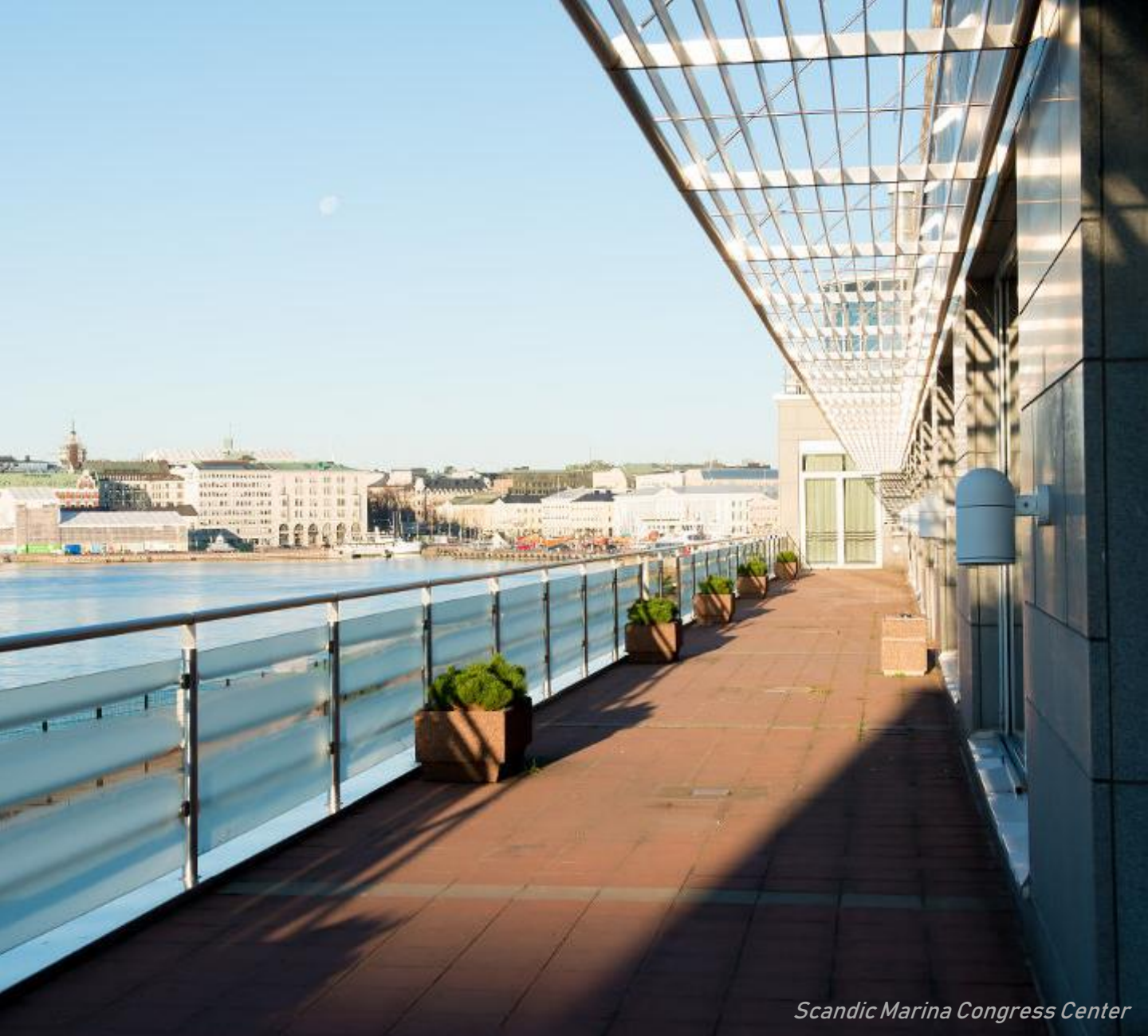
Scandic Marina Congress Center